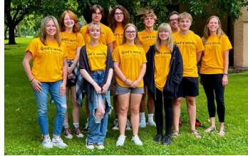
YSJ pictured before heading to New Orleans last month.

On July 28 during worship, hear YSJ talk about its time in New Orleans at the 2024 ELCA Youth Gathering. After worship service, come enjoy a sweet treat with YSJ. Also, registration for Sunday School will be available on-site.